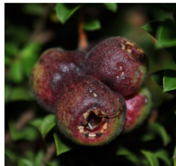
Photo left: Our Muntries ( Kunzea pomifera ) are starting to produce berries which can be eaten raw or cooked and made into a jam. Above are the flowers and ripe berries.

We acknowledge the Eastern Maar people as the traditional owners of the land on which we live and pay our respects to their elders past and present.